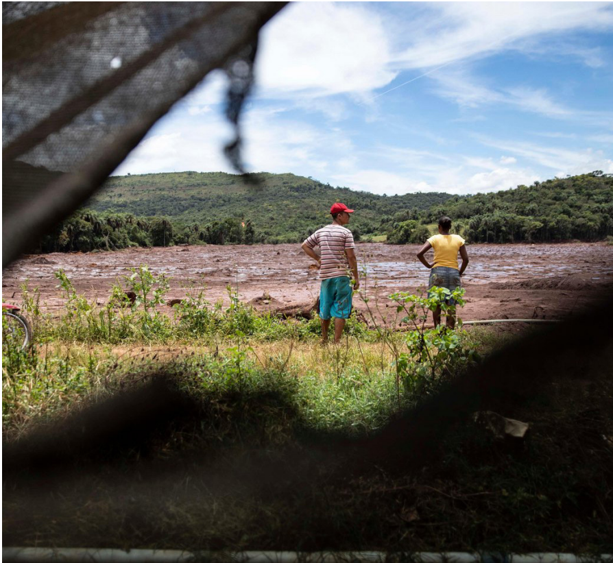
Brumadinho, the area affected by the collapse of a tailings dam in the state of Minas Gerais, Brazil,

2050, demonstrating significant progress. The resolution has been coordinated by ShareAction and co-filed by at least four LAPFF members as well as other institutional investors such as Sarasin. It remains to be seen whether the Barclays resolution will be filed in some form, but the Forum was reasonably happy with Barclay's engagement on this issue.