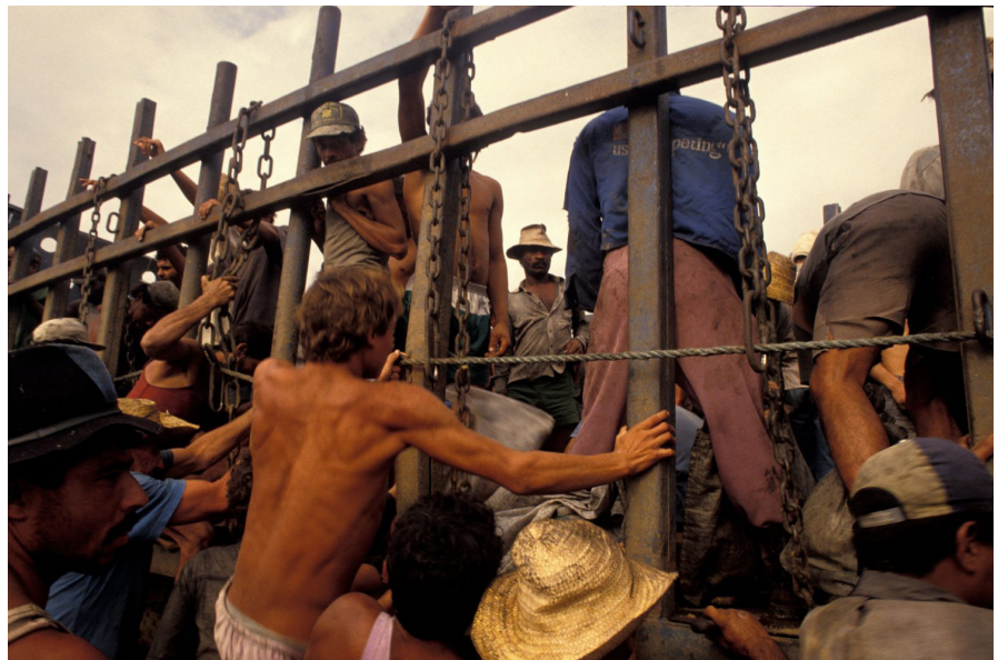
Not all companies are compliant with its provisions in the Modern Slavery act

In the wake of the Christchurch mosque shooting, LAPFF has been working with New Zealand Super Fund and other