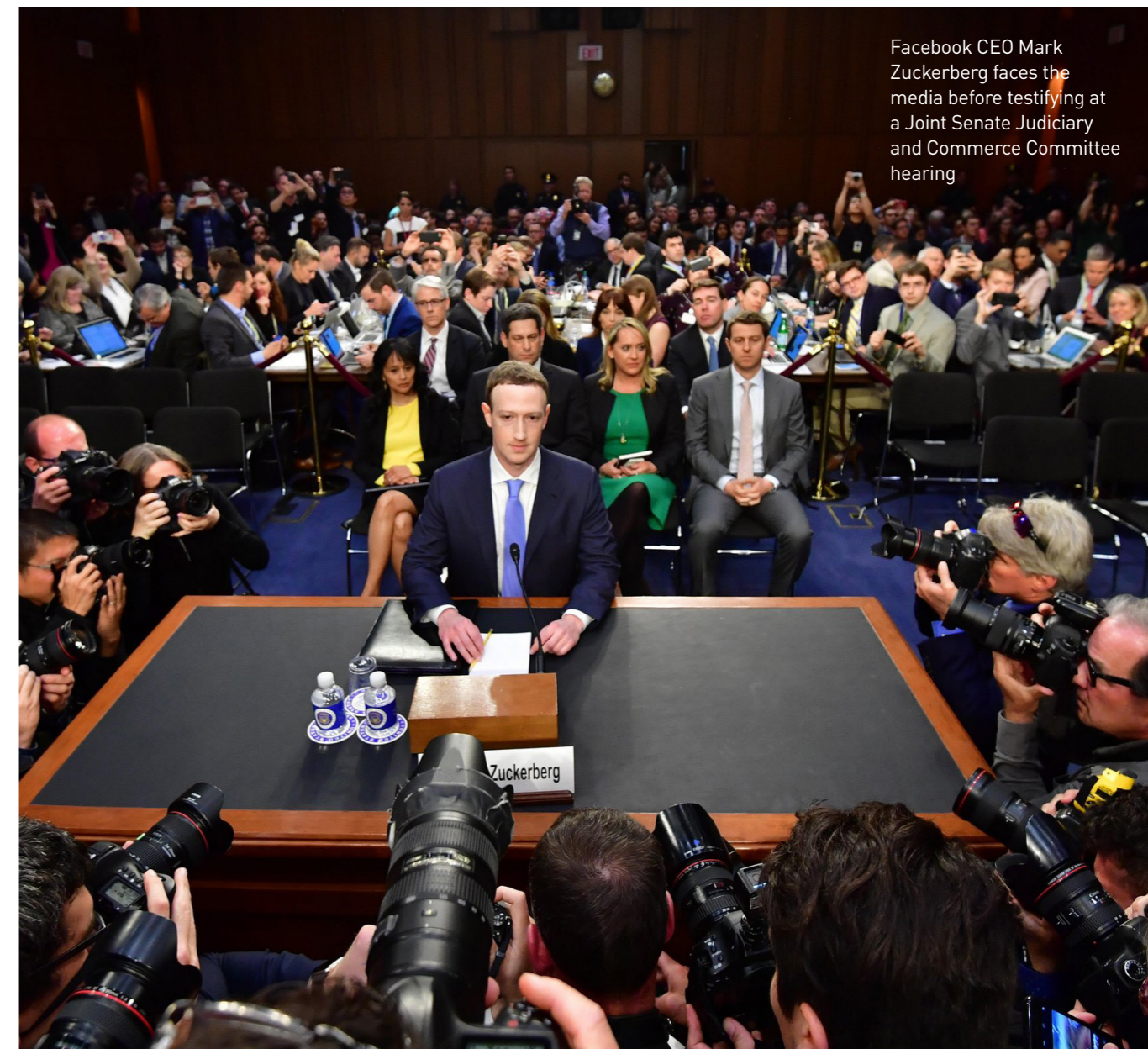
Facebook CEO Mark Zuckerberg faces the media before testifying at a Joint Senate Judiciary and Commerce Committee hearing